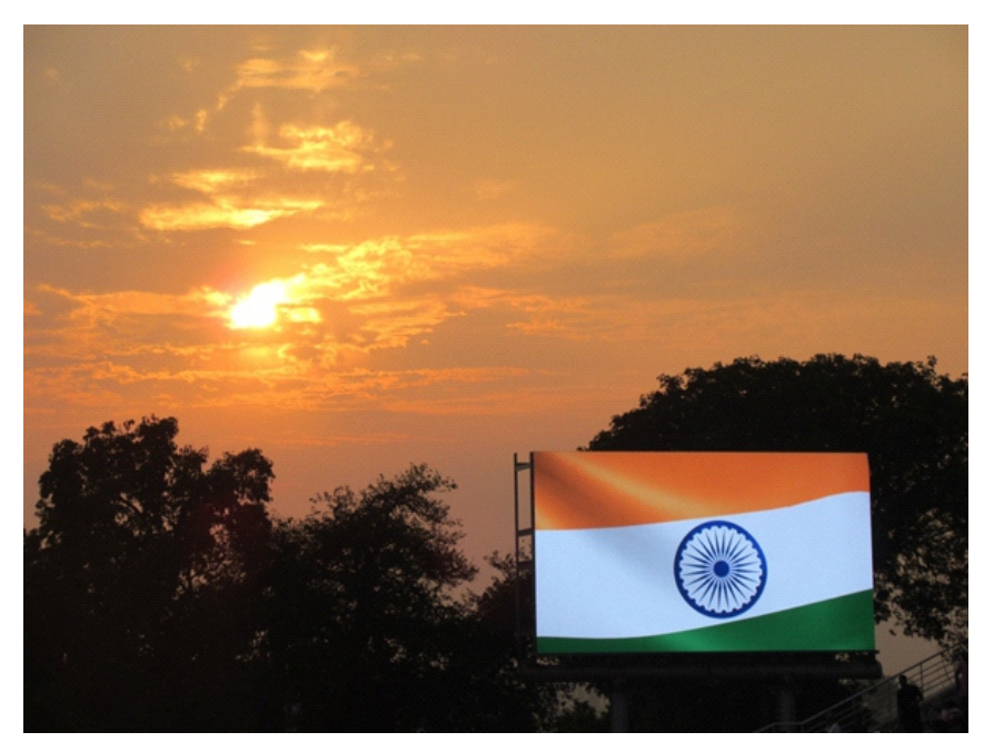
Location: Wagha Border